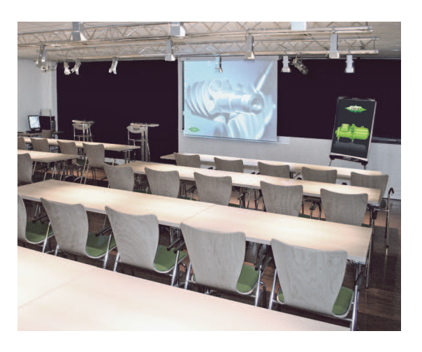
Training operators and field service technicians. Boosting skills is one of our missions.