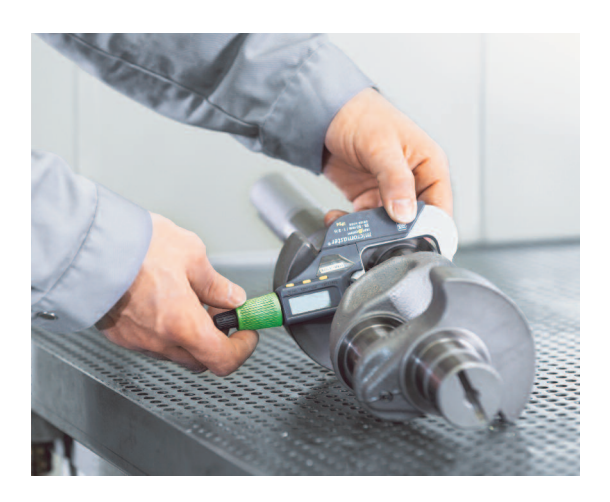
No compromise: Gauging the crankpins ensures the shaft's reusability.