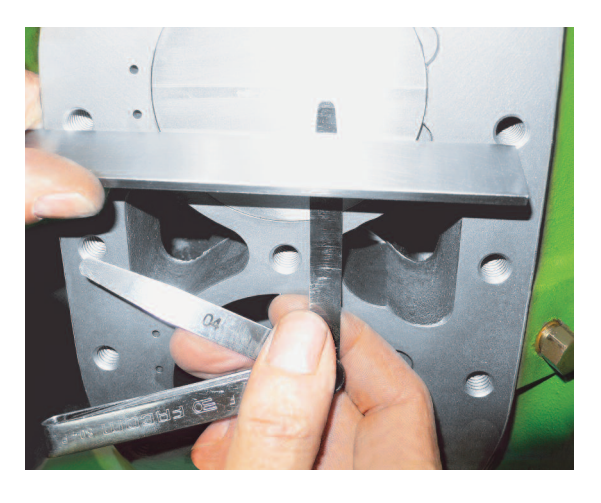
State of the art reassembly: Performance must be preserved, here checking the dead volume.

Resources: always keeping you updated and giving you options and alternatives to suit your business requirements: these are the resources that Green Point is proud to offer. Not only doing the job but offering solutions as well.