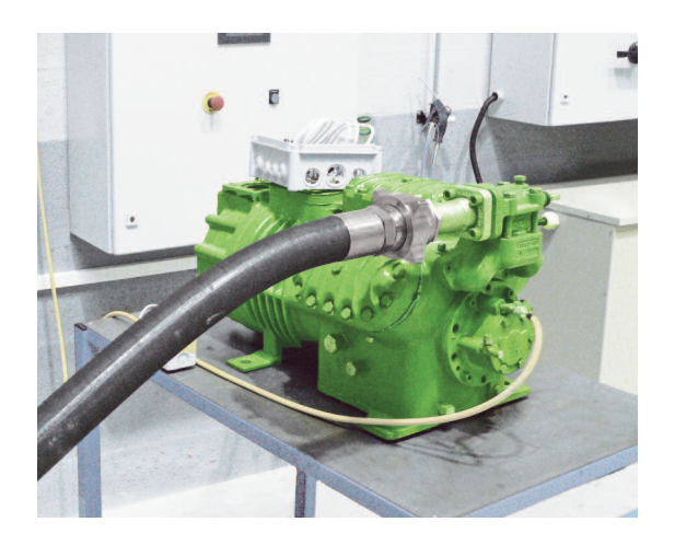
Running test of the compressor: All main operating parameters are in the scope.