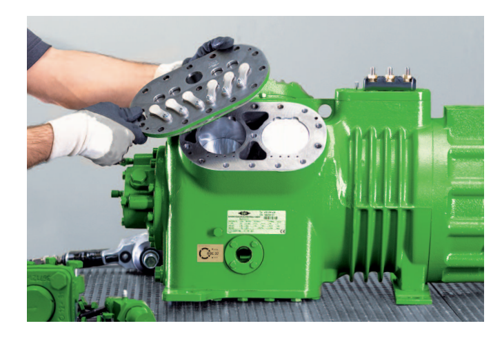
Professional inspections: All compressors are completely stripped down. All parts are analysed.