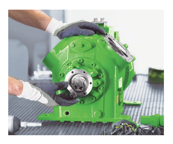
Careful reassembly of new and reusable parts. Perfect timing for another QC.