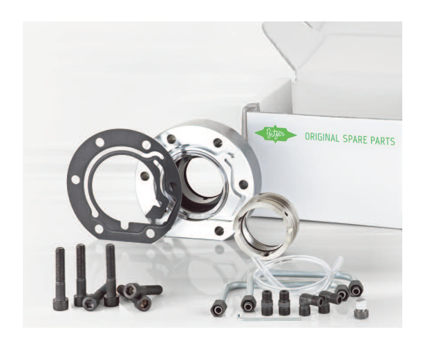
Genuine spare parts out of the box: BITZER's unequalled quality for servicing and repairs.