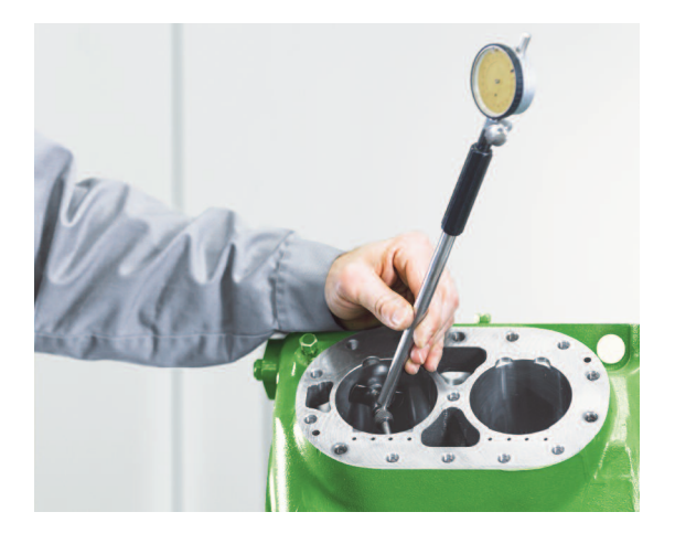
Competence and Quality: BITZER dimensions are checked, gaging of main parts is a must.

The Green Point network focuses its activities to fulfill your requirements. Close cooperation with BITZER ensures consistent quality for all the operations carried out in each workshop. Each Green Point workshop combines local market awareness with the global vision of a leading manufacturer like BITZER, minimizing the communication barriers within each region and ensuring achievable consistency in quality and reliability.